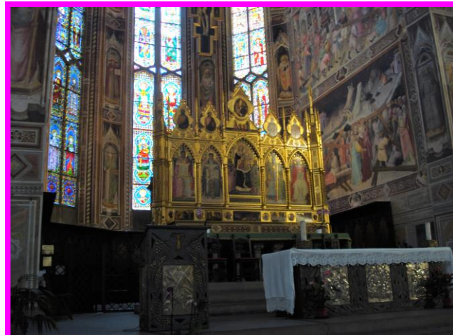
The altars/interiors of the churches are breathtaking.