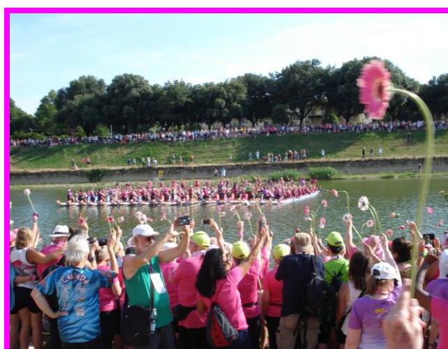
The Special and Memorable BCS Flower Ceremony!