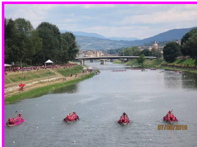
Final Race – MCD - Lane #2 (Second boat from left).