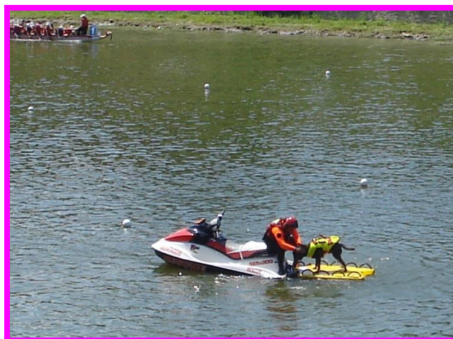
A Medic and his rescue dog ready, if needed!