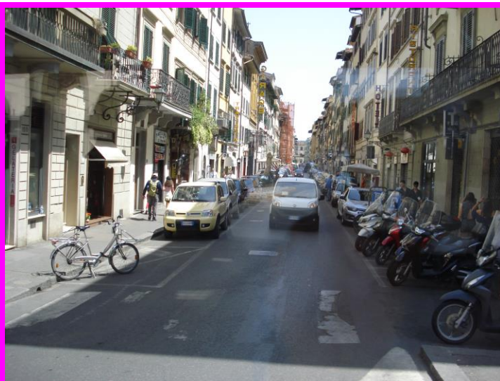
The stone streets are narrow and there's a lot of scooters.

Can you guess where we are? Where in the world were these photos taken? Turn the page and find out where and who went!