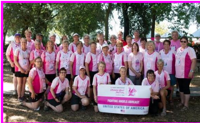
The Fighting Angels Abreast Team at the July, 2018 IBCPC Festival in Florence, Italy. BC Survivors from Iowa, Minnesota and Wisconsin joined together to share in the IBCPC Participatory Festival experience along with many Supporters to make for a memorable trip!