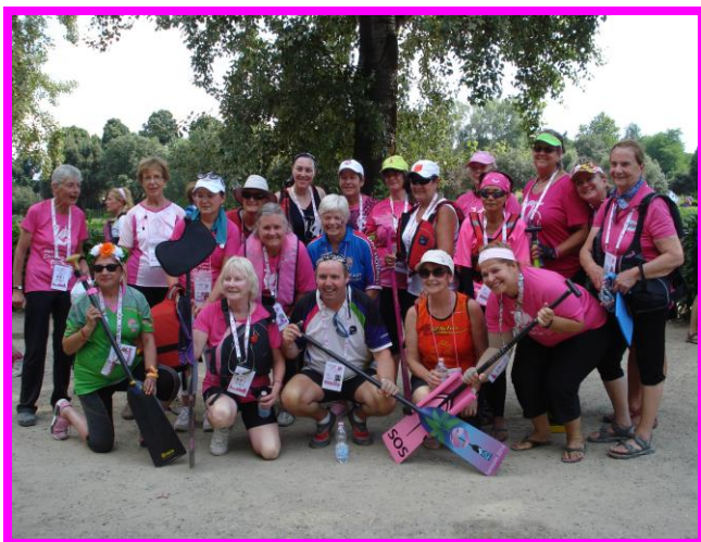
One of the excited Sandy Smith Global Finale Teams!