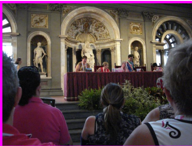
IBCPC Congress in session at Salon dei Cinquecento.