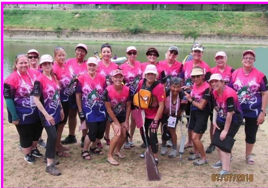
The Motor City Dragons team is all smiles after completing Race #2 at the 2018 IBCPC Participatory Festival in Florence, Italy!