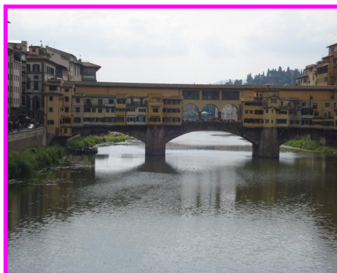
The historic Ponte Vecchio Bridge over the Arno River featuring jewelers, art dealers and souvenir sellers.