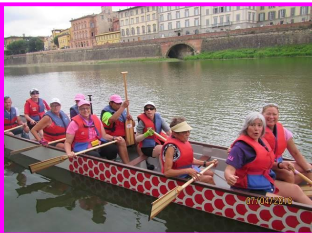
MCD Workout under the Ponte Vecchio Bridge.