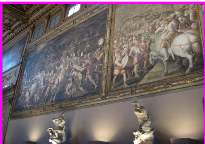
Congress meeting room--huge frescos on both sides..