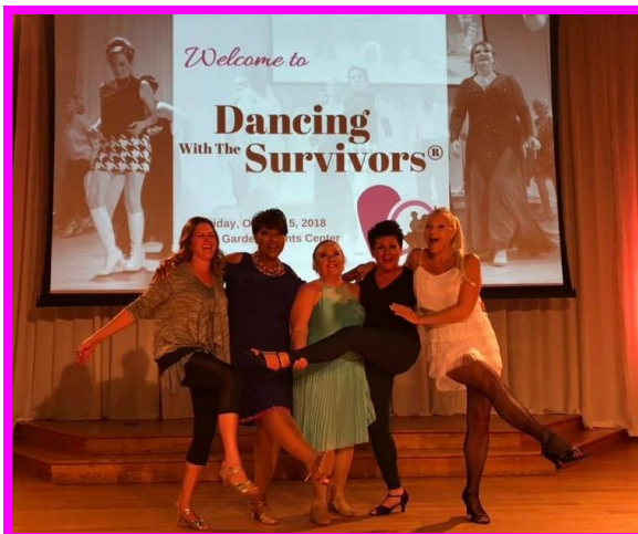
Great way to 'kick up your heels' and have fun!

(Photos and Article Submitted by Csilla)