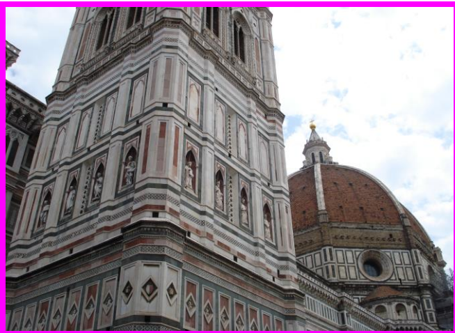
Florence's Cathedral / Duomo stands tall over the city.