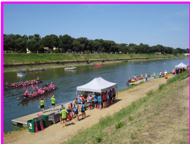
Teams at the Loading and Unloading Docks.