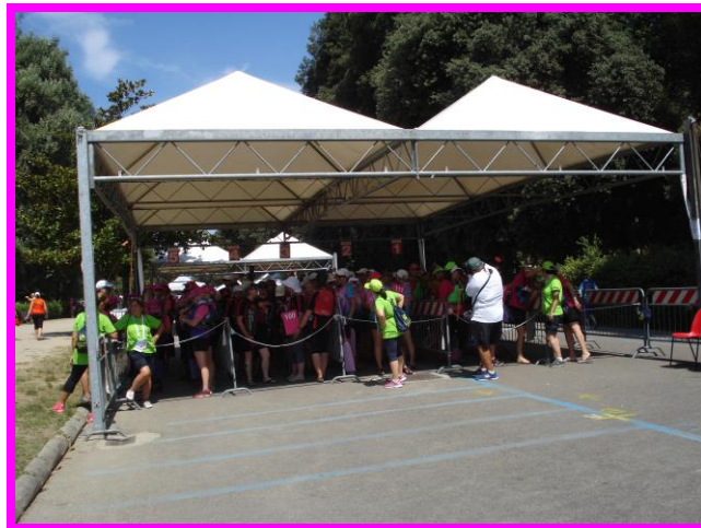
In the Marshalling area getting ready to paddle!