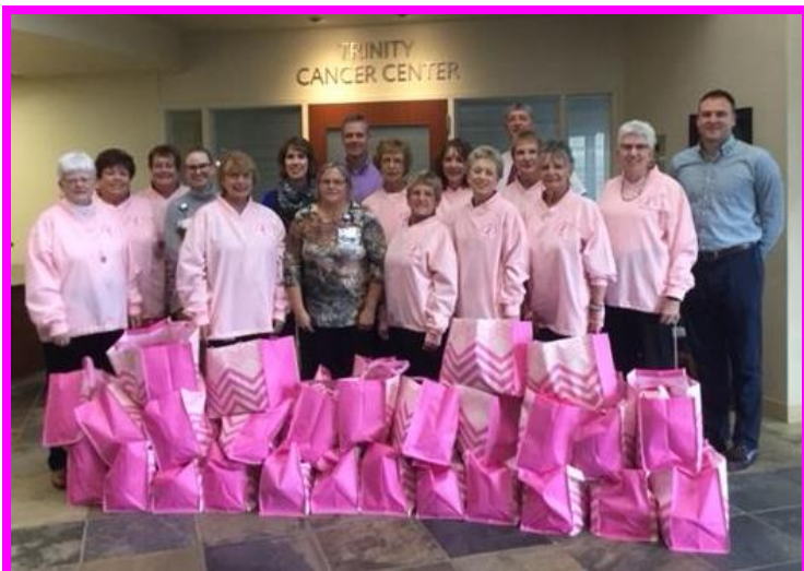
Cancer Center Care Bags were made up by team members and presented to the Trinity Hospital Cancer Center in Fort Dodge, Iowa for patients going through BC treatment.