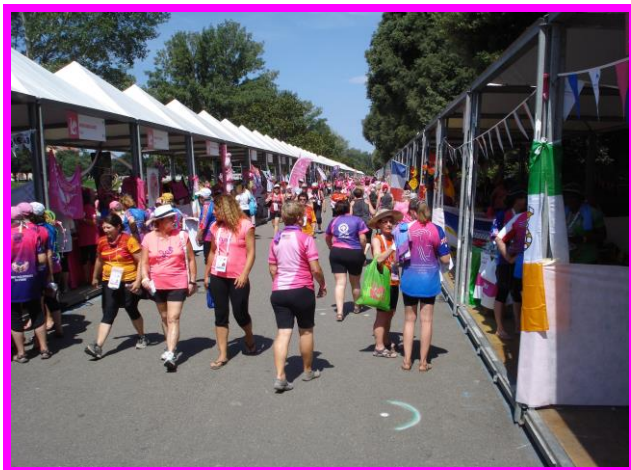
Visiting from tent to tent with the 121 teams!