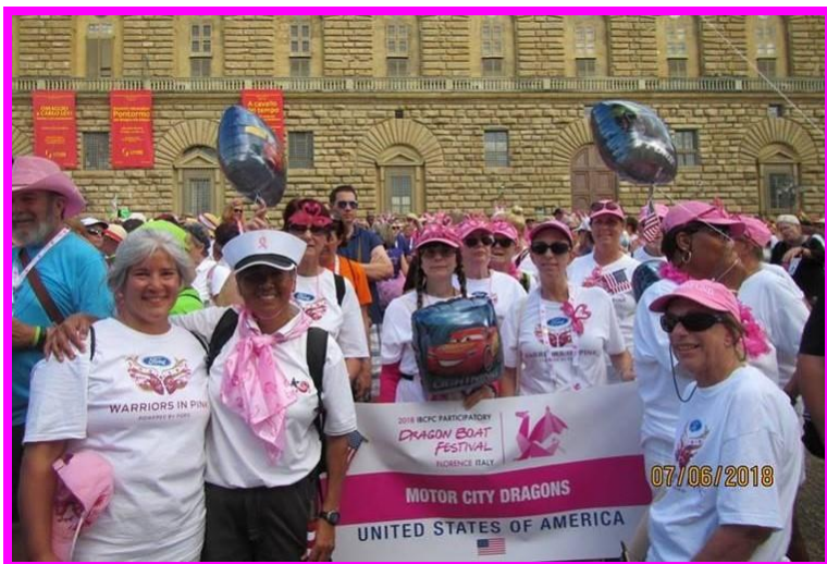
Motor City Dragons in Pink Parade in front of Pitti Palace.

(Photos and Article Submitted by Csilla)