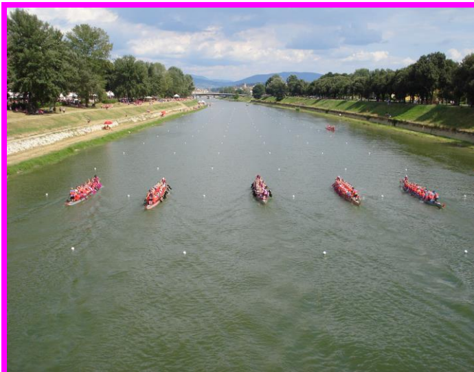
The Arno River was wide - had approx. 5,000 participants.