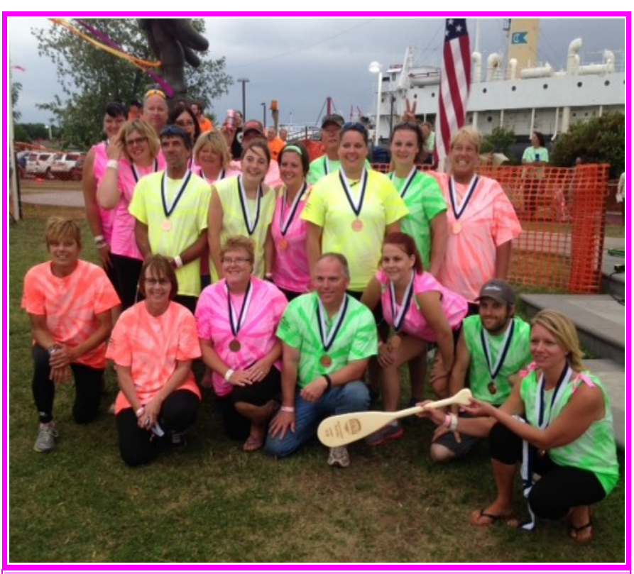
Many proud faces with big smiles after a great race for a win!

We are an active participant each year in the Lake Superior Dragon Boat races by rowing. Since we are a 501(c)(3) non-profit (<a href="http://www.circleofhopeduluth.org">http://www.circleofhopeduluth.org</a>), we cannot fundraise for other non-profits.