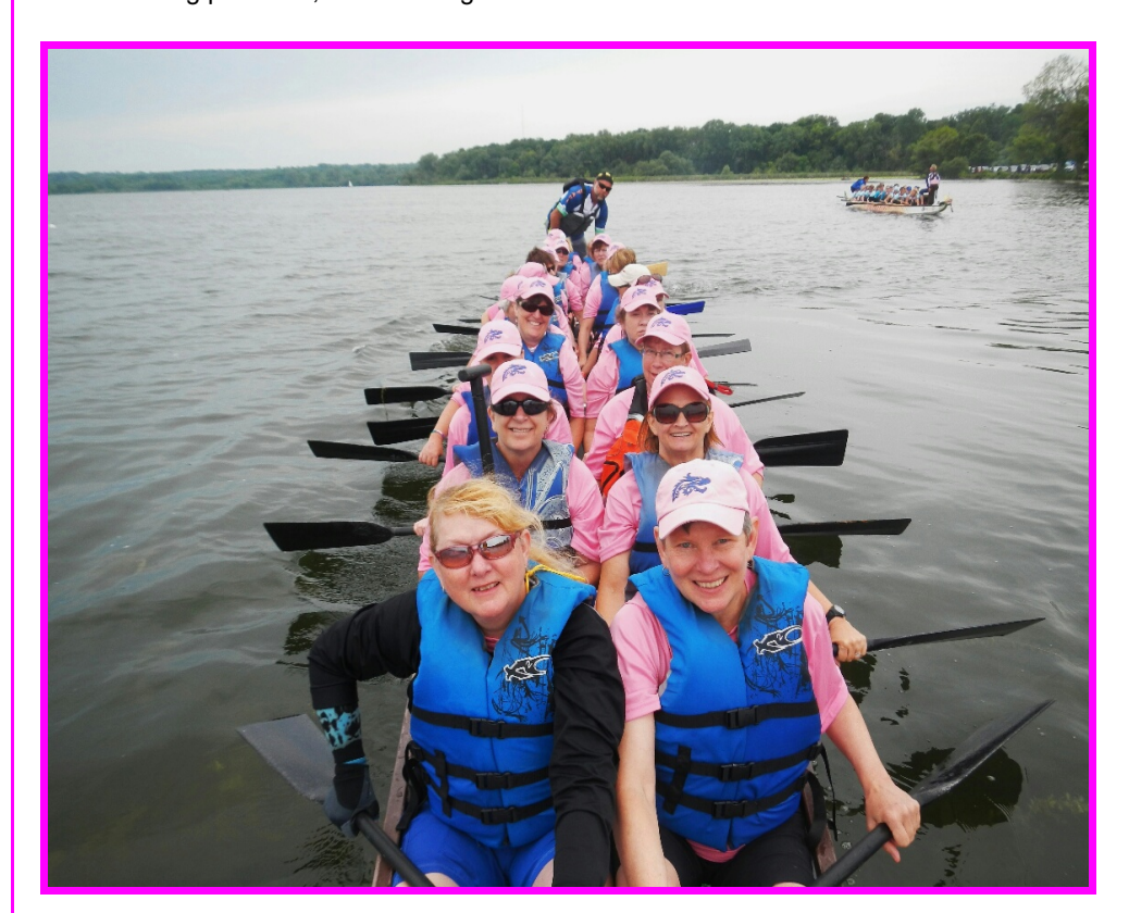
The La Crosse Mississippi Sisters are hoping to see you at their July 2016 Festival!

2015 saw the La Crosse, Wisconsin Dragon Boat Breast Cancer Survivor team choose a new name and expand its' involvement in racing within the region. After much thought we chose the name "La Crosse Mississippi Sisters" because it describes our location, represents our connection as sisters in our cancer experience and in our everyday lives, and it honors the Franciscan Sisters who are committed to caring for others and specifically committed to supporting our Big Blue Dragon Boat Festival and breast cancer survivors. Our team allows for commitment to paddling on whatever level our survivors choose. Some paddle only in our local festival and some practice weekly and in 2015 paddled as a team in the Capital Lakes Festival in Madison, Wisconsin and as a survivor/supporter team in the Oshkosh event. With the help of our lowa and Minnesota sisters, we were able to fill 2 boats for our La Crosse Big Blue Dragon Boat Festival Breast Cancer Survivor races. As we look ahead into 2016, we are organizing to provide a weekly exercise class, looking at scheduling practices, and deciding on what other events we want to enter.