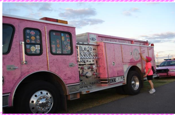
Also had Pink fire trucks to autograph!

An aerial view of the IBCPC Participatory Dragon Boat Festival Opening Ceremony at Nathan Benderson Park. Team members are gathered in the middle wearing their pink festival shirt listening to the speakers. Team tents were at the top of the picture on the right side, teams gathered and loaded into the boats in the middle on the right side, and in the foreground on the right side were vendor tents and the spectator grandstands.