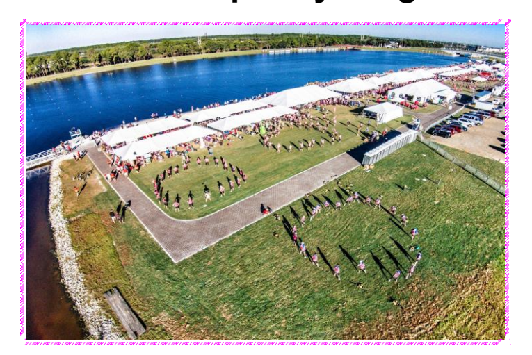
An aerial view of teams warming up before racing at the race site, Nathan Benderson Park.