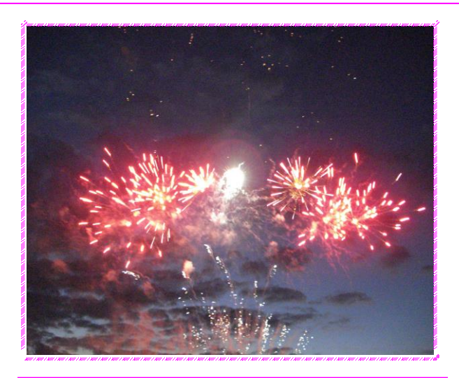
Fireworks spectacular at the Festival Ceremony!