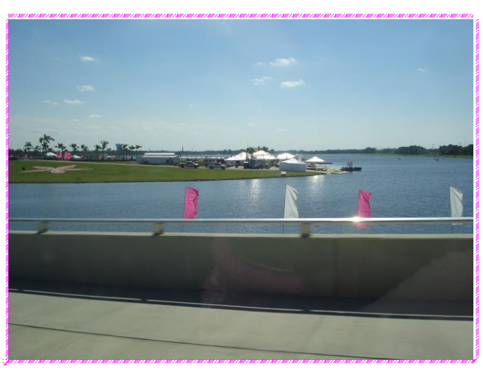
As our bus leaves the city, we travel onward, around the bend and finally, we see the Nathan Benderson Park where the activities and races were held for the weekend!