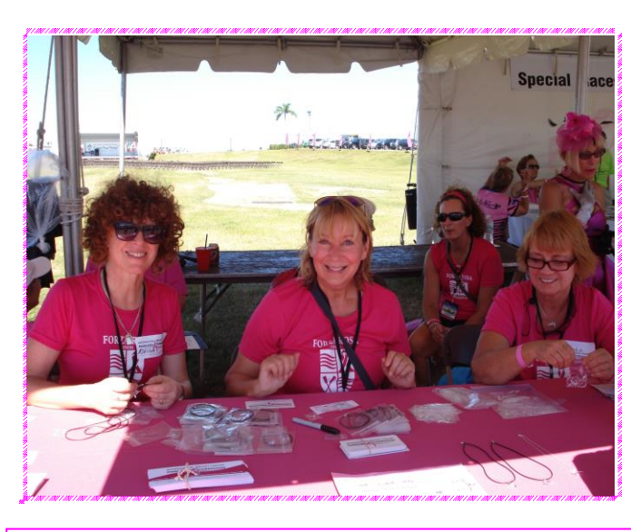
IBCPC volunteers in the IBCPC booth at the Festival with plenty of information for the paddlers and lots of smiles!