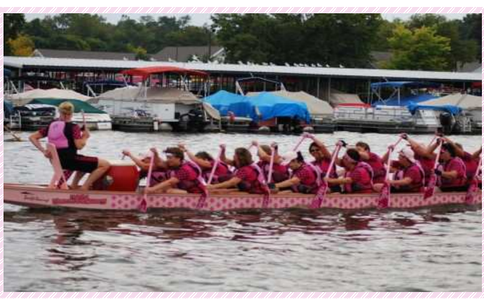
FDJ International Race for the Cure, July 11, 2009