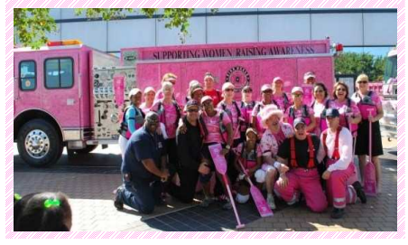
Supporting Women Raising Awareness Pink Fire Trucks.