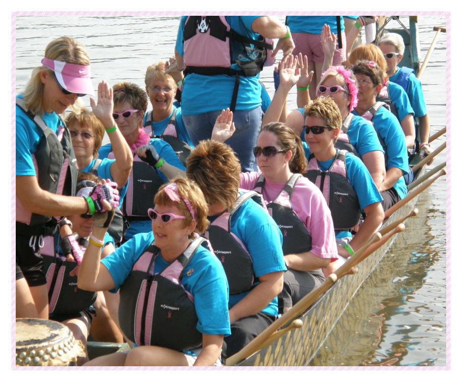
A team of 'Winners' loading the boat to have fun!