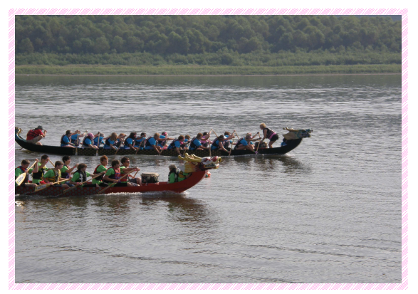
What a close and exciting race!

Breast of Friends from Dubuque, lowa had another awesome season in 2009 providing hope to everyone that there is a great life after breast cancer! We set out to prove this time & time again and I know our message has reached hundreds of women in the tri-state area as well as on our journey to Wallaceburg, Canada and Fort Dodge, Iowa.