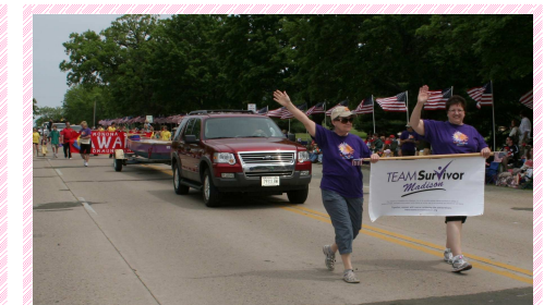
The dragon boat was a hit at the Annual Monoma Memorial Day Parade on May 25.